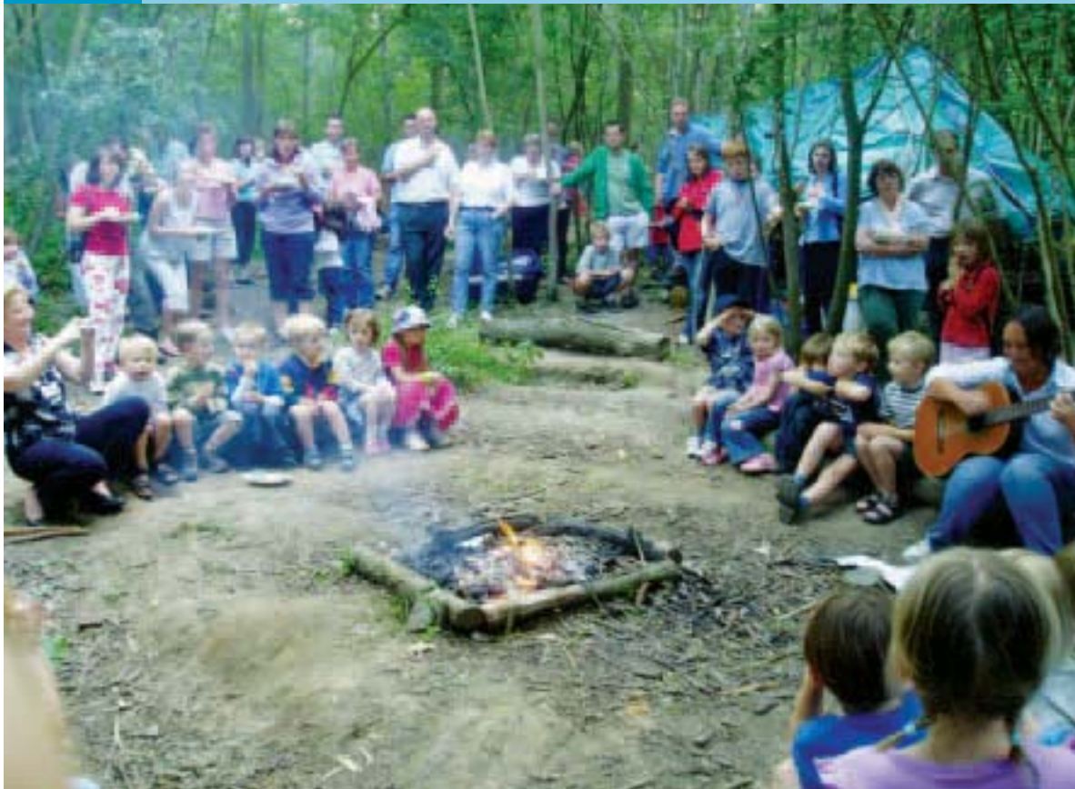
Figure 10 A celebration day to introduce parents to Forest School

This evaluation highlights that the impact of Forest School occurs not only in the child who is fortunate enough to attend: there are also 'ripple effects' within the family and within the wider community, including the child's school. Many of the children wanted to take their parents to Forest School or to woodland to display some of the knowledge they had gained. One parent stated that the family liked to visit woodlands at weekends; they all put on their wellington boots and their child has told them about the importance of taking drinks and a snack for everyone.