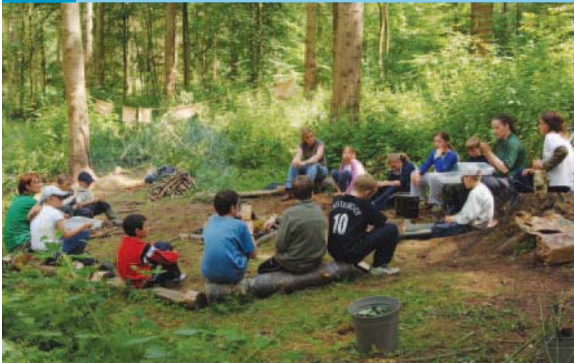
Figure 2 Discussing activities at Forest School

The Flintshire case study looked at the impact of Forest School contact time on selected groups of Year 6 pupils as they moved from primary to secondary school education. Children were identified by teachers at six feeder primary schools as needing extra support during the transition to two secondary schools. The children spent the last six weeks of their summer term attending Forest School and also had a three-day summer school there. They carried on attending Forest School once they had made the transition to their secondary school (Figure 2).