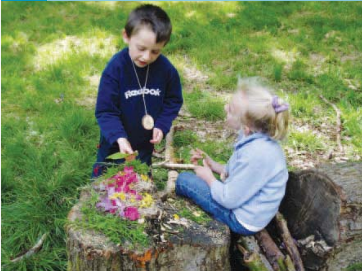
Figure 4 Creating a piece of forest art

Alongside this qualitative and quantitative information, practitioners recorded background data for each session, noting what was taking place, the aims of the session, and highlighting weather conditions. These practitioners were not researchers but they did have detailed knowledge of the children and were often able to observe them both in the classroom and at Forest School. Oxfordshire and Shropshire also collected some informal interview data from parents, teachers and children at the end of the series of sessions.