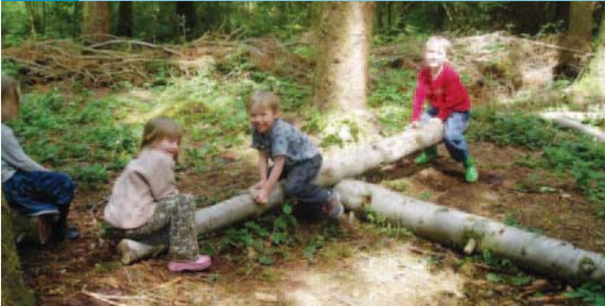
Figure 9 Using logs to create their own seesaw