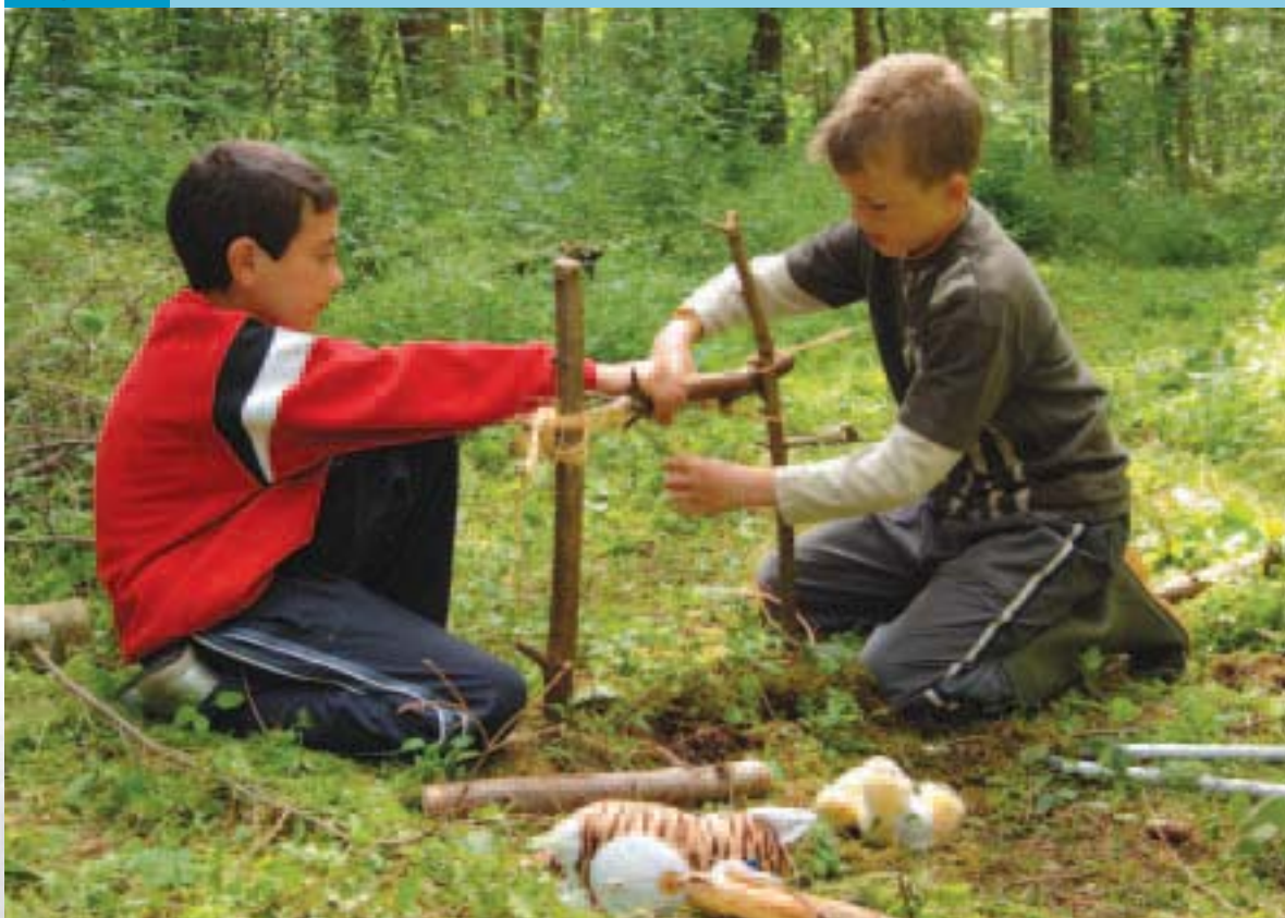
Figure 6 Building a mini-shelter for toy animals