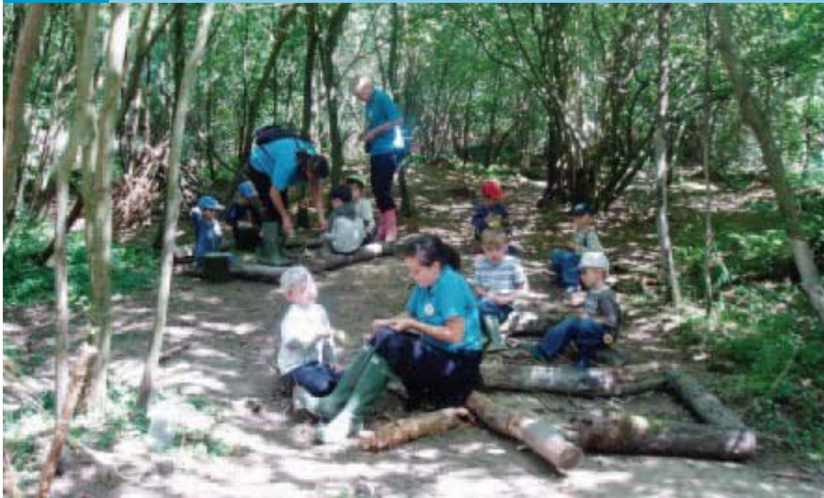
Figure 11 Learning to use tools at Forest School

There is growing concern among environmentalists that many children and young people are not having contact with nature. Research has shown that children who use woodlands when young are more likely to do so as adults (Bell et al. , 2003). If this connection to the natural environment is lost due to parents' concerns about children's safety, or because of the dominance of indoor activities, centred on television and computer use, then there is a chance that a vital opportunity for connecting people with the natural environment is being lost. The Real World Learning campaign is currently lobbying the government to promote outdoor education and out-of-school activities for this very reason (Cooper, 2005).