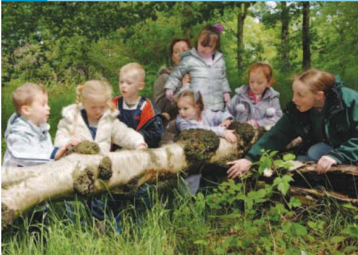
Figure 7 FC ranger talking with children about what they have found