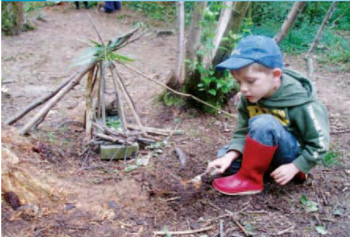
Figure 8 Building a house for Sally Squirrel

The children can also become excited when they discover new animals, plants or other natural phenomena they have not seen before. The freedom of the Forest School setting inspires children to use their imagination (Figure 8). Practitioners described several examples of the imaginary games invented by the children. For instance, they dig for gold or find hidden treasure and search for dragons. This illustrates the freer atmosphere that is part of the Forest School approach.